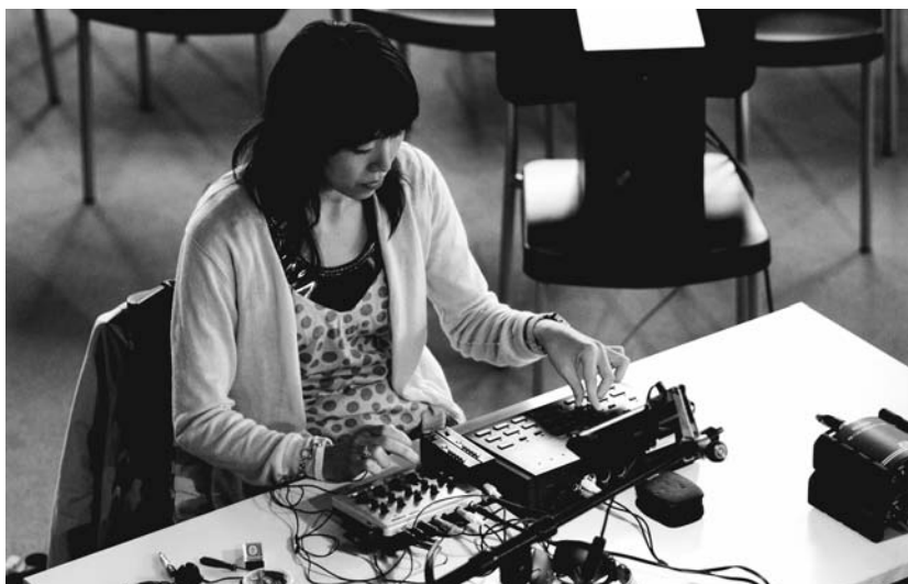
Figure 5. Sachiko M's empty sampler.

their performers, attempt to be “empty” of outside signal, but still admit no “input” within their own enclosed systems, relying instead on feedback loops and built-in noise.