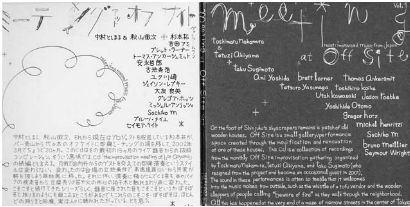
Figure 3. Meeting at Off Site , vol. 1 cover.

an independent label with a unique graphic look developed by house designer Tanabe Masae (see Figure 3). The label sells the majority of its releases in North American and European markets, and both the magazine and liner notes are translated into English by Suzuki's American wife Cathy Fishman (Suzuki 2001, 2003). Through the recordings released by IMFJ , the “Meeting at Off Site” concert series became a prototype for onkyō performance events and the model for a new improvisational protocol. 4 The “Meeting at Off Site” was both local and movable: it identified onkyō as a Tokyo-based music, but was open to anyone and could potentially be practiced anywhere, as a new paradigm of improvisational performance. However, onkyō continued to be associated almost exclusively with Off Site's core group, especially in festivals meant to introduce the style to new audiences, such as the “ Onkyō Marathon” at the Japan Society in New York City in 2004, or the “Japan-o-Rama” tour of England in 2002.