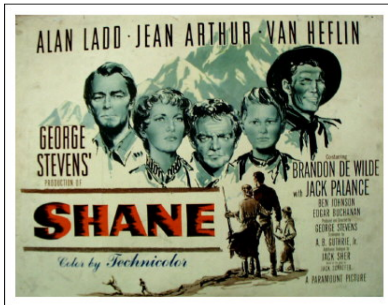
Figure 3. Movie Poster for Shane (1953).

The song is about a man imagining himself as a lonely cowboy Shane, complete with a cigarette and a pair of golden spurs on his boots. 41 Eyesburn's 1999 version takes the following verse of Haustor's song and makes it the core of their song: