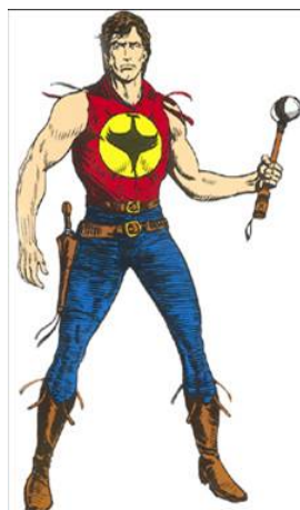
Figure 1. Picture of Zagor.

It is the words of the refrain that provide the axis for the construction of the song’s meaning and a mockingly serious invitation: to examine our relationship with the past and the present. “Karamba karambita” are the words of the immensely popular comic book “Zagor” from the 1970s. Originally Italian, this comic book was translated to Serbian and widely distributed throughout Yugoslavia during the 1970s, a period of high economic and cultural prosperity.