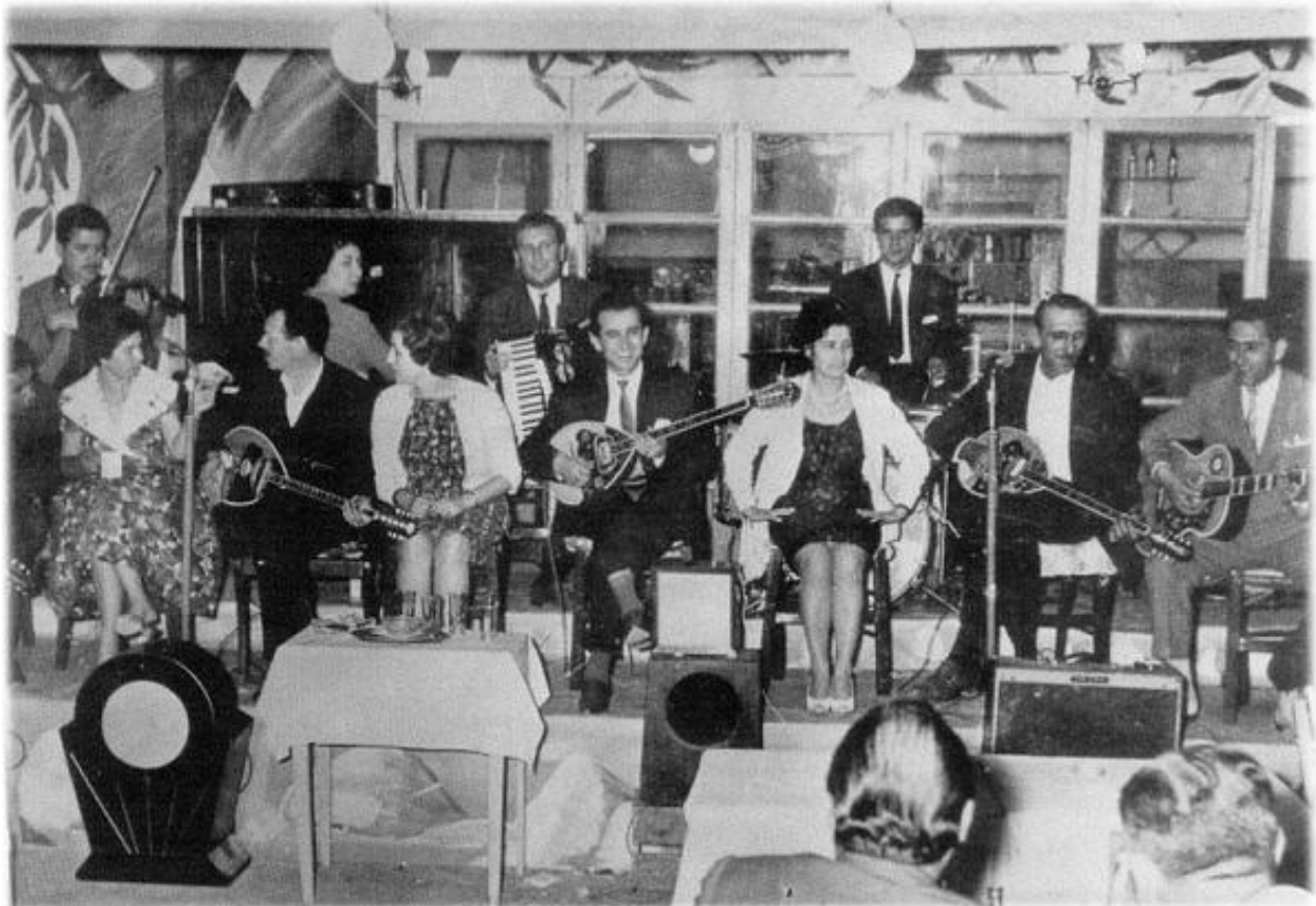
Athenian nightclub in the early 1960s. Larger orchestras (the one shown includes three female singers and three buzuki players the leftmost of whom is the famous composer Vasilis Tsitsanis) and, eventually, electric amplification helped shape the characteristic sound of “new” rebetiko during the decades following World War II.

Comment: Something close to a national anthem, this song is one of Tsitsanis’ most popular compositions. It represents the “new” style of rebetiko that became popular after the Second World War.